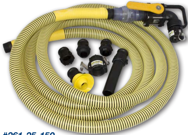
#261-25-150 25ft Assembly Shown

Standard Length Assemblies 25 ft. Order No. 261-25-150 33 ft. Order No. 261-33-150 50 ft. Order No. 261-50-150 Custom Length Assemblies 5ft to 100ft