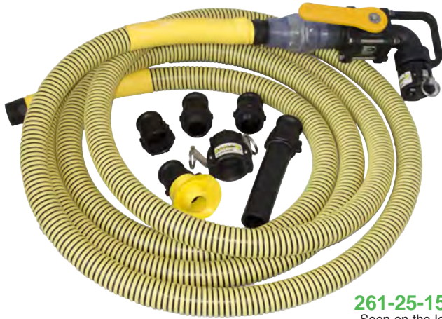
261-25-150 Seen on the left