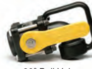
90° Ball Valve 264-90-150