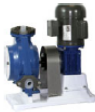
Model 286EP-.75hp Compact Peristaltic