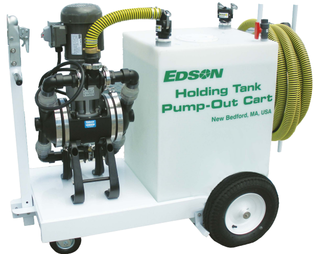
28204 Pumpout Cart (Shown with 25261 pump option installed)