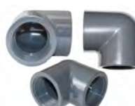
90° 2" 160-A-2008