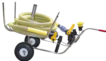
Portable Hose Handler #26050 50 ft to 100 ft Assemblies For Portable Pumps