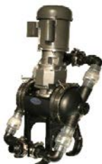
Model 25261 Double Diaphragm

The 28204 (40 gal) Pumpout Cart is an ideal way to provide pump out service throughout the marina without installing plumbing. Boat yards frequently need to pump out a boat either when in dry dock or when pulling the boat for the season. The portable design can be integrated into a plumbing infrastructure to provide a fixed station throughout the marina and become portable as needed. The compact 40 gallon unit is designed to fit down 30" ganways. The versatile cart is designed to accept our diaphragm pump options, or the powerful peristaltic options shown below.