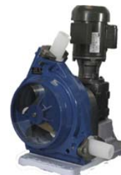
Model 286EP-1hp STD Peristaltic