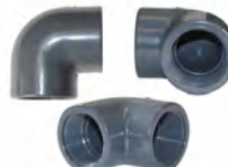
90° 1½" 160-A-1023