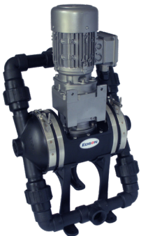
#25261 DOUBLE DIAPHRAGM