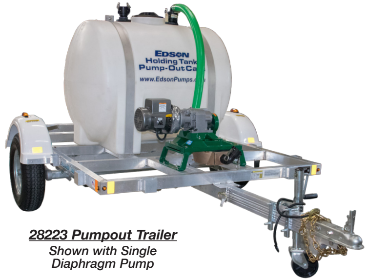
28223 Pumpout Trailer Shown with Single Diaphragm Pump