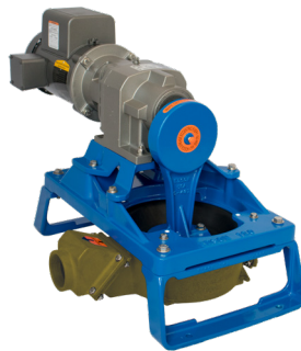
#120EL SINGLE DIAPHRAGM