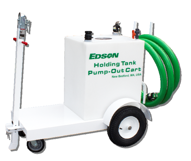
28206 Pumpout Cart (Shown without pump option installed)